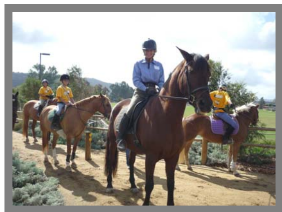
Walnut Grove Park Trail and staging area City of San Marcos, Twin Oaks Valley

Community trails serve a different function than regional trails, which are focused on the provision of long linear distances. Instead, community trails are “local public facilities” in close proximity to residents that provide transportation, recreation, access, infrastructure, linkages and safe routes throughout a community. The Community Trails Master Plan (CTMP) involves both trail development and management on public, semi-public and private lands. The CTMP has established two forms of non-motorized facilities called “Trails” and “Pathways” that provide passive recreational and alternative modes of transportation.